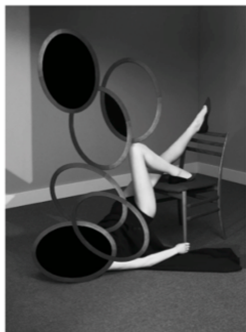
Noé SENDAS Wallpaper* Girl (Dior) 2015 Ink jet print on lustre paper Signed, titled and editioned in ink on verso 70 x 90 cm

Galerie Miranda will present a selection of signed artist prints of key works from the 1950s, exhibited in Paris for the first time