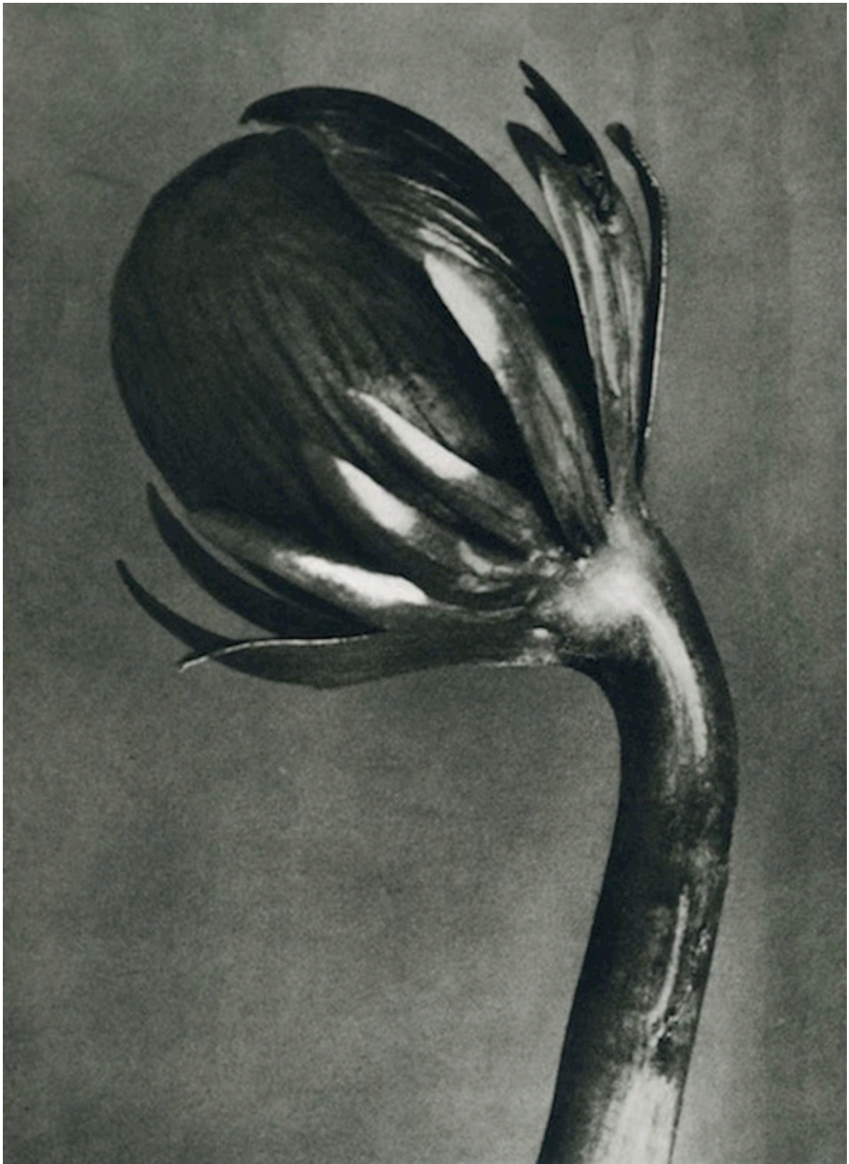
Karl BLOSSFELDT Eranthis hyemalis (Wintering, winter aconite), 1928 1st edition photogravure 23,4 x 32,3 cm © Karl Blossfeldt courtesy of Galerie Miranda