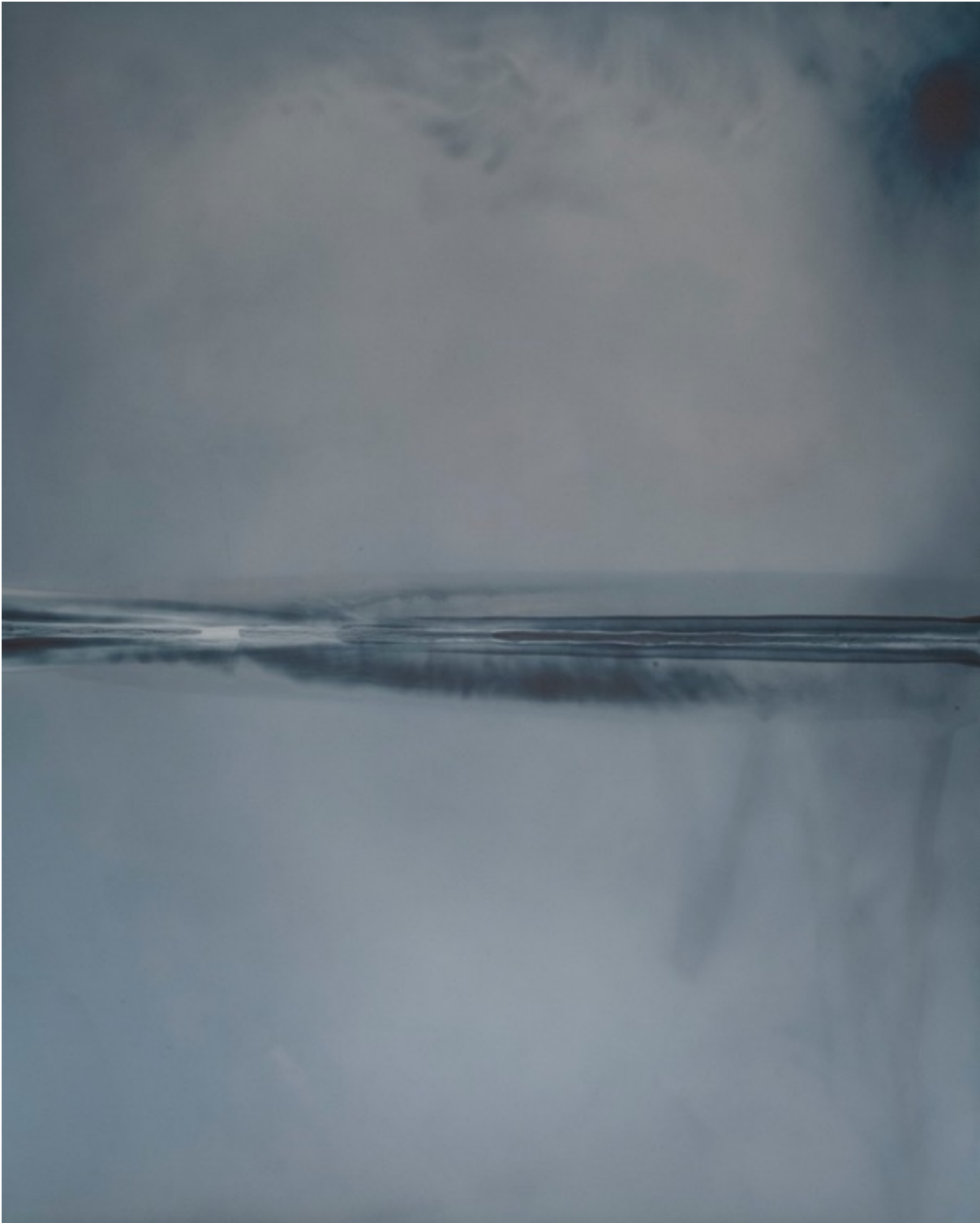
CHUCK KELTON A View, Not from A Window #650, 2020 Chemigram and photogram, unique, 50x40cm (c) Chuck Kelton / Galerie Miranda