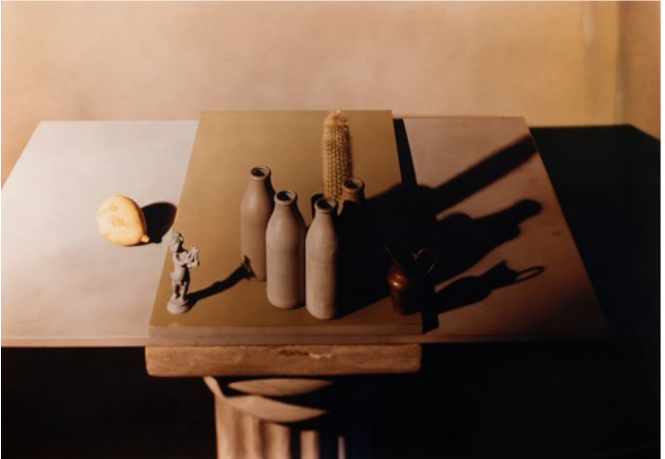
JAN GROOVER Untitled, FS 38.1, 1987 Vintage chromogenic print, 20x24 inch / 50,8x61 cm (c) Jan Groover / Galerie Miranda