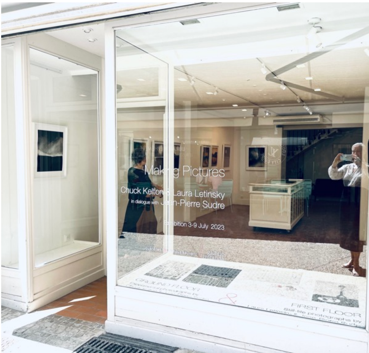
Street view : Galerie Miranda x galerie quand les fleurs sauvent, Arles pop-up, July 2023

For those who couldn't make it to the gallery's Arles pop-up show last July, produced in collaboration with quand les fleurs nous sauvent gallery, please join us in Paris in September/October to discover a selection of these beautiful works. The fall exhibition will unfold in two chapters and also include several new pieces not shown in Arles. Each exhibition chapter features a major contemporary artist in dialogue with a major historical artist, in the fields of experimental and still life photography.