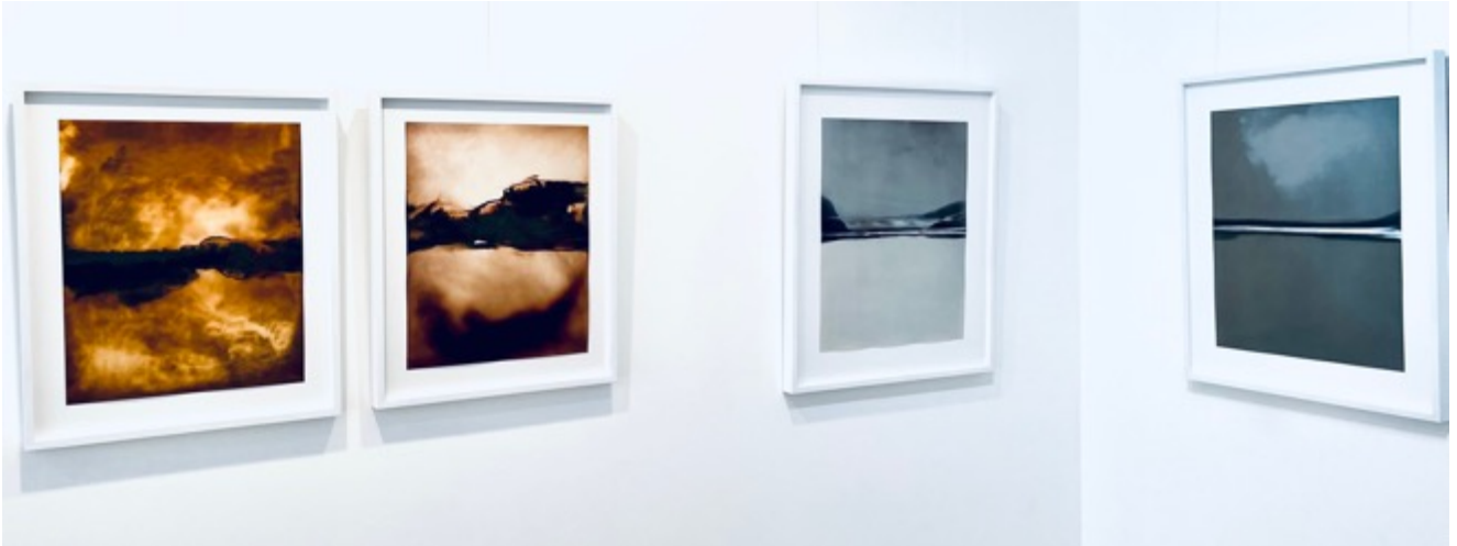
Chuck Kelton: installation view, Arles pop-up, July 2023