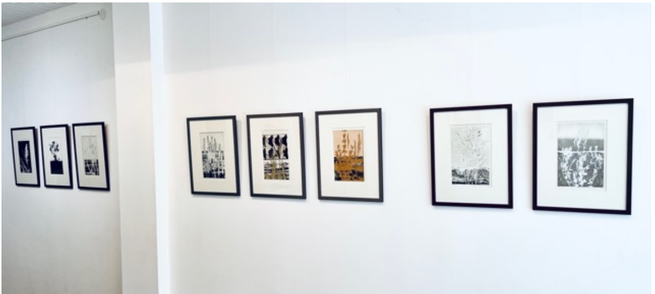
Jean-Pierre Sudre: installation view, Arles pop-up, July 2023