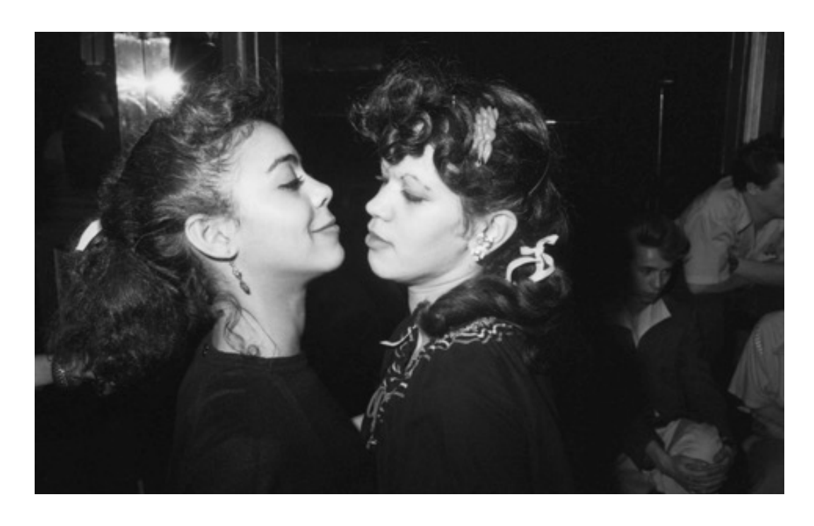
PHILIPPE CHANCEL **Rebels, Paris 1982*