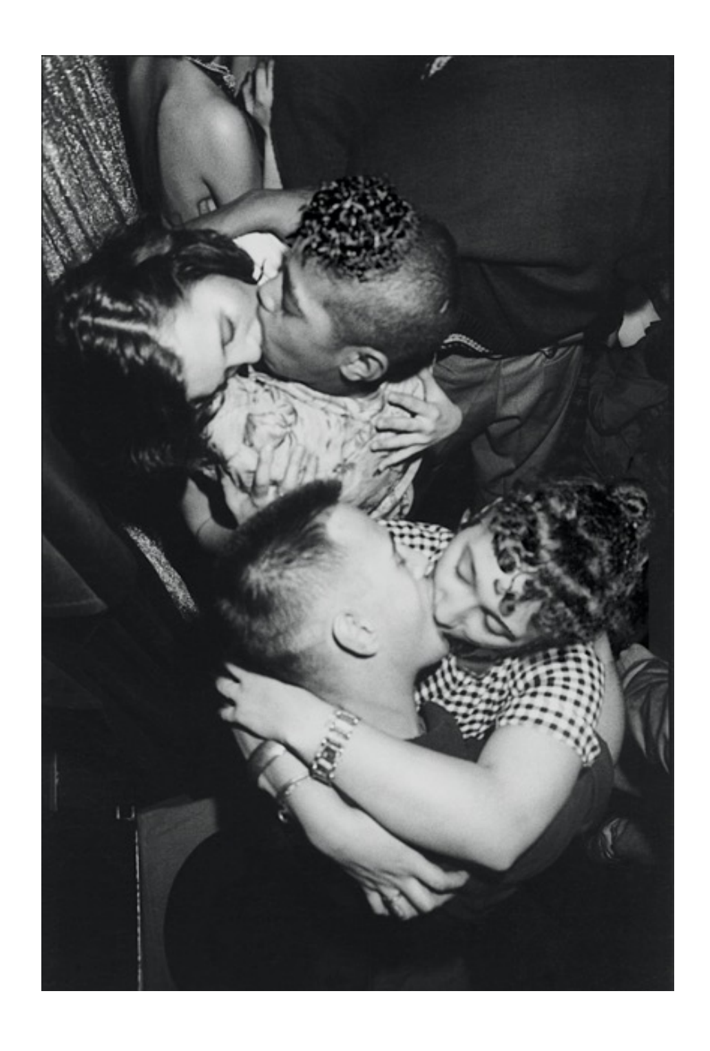
**Rebels, Paris 1982