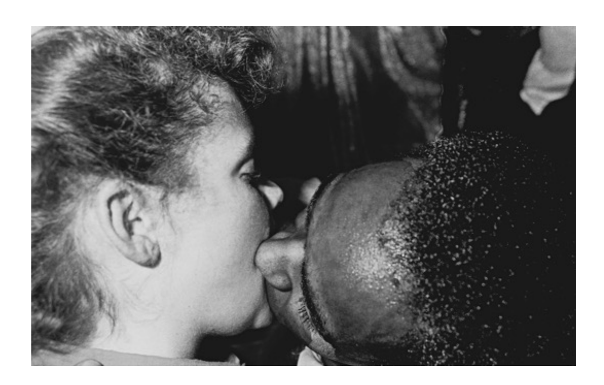
Rebels, Paris 1982