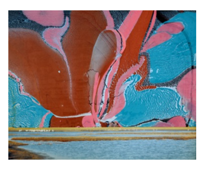
Chloe SELLS Peacocks, 2019 C-Type print with acrylic paint 10 x 12 cm Unique (c) Chloe Sells / Galerie Miranda