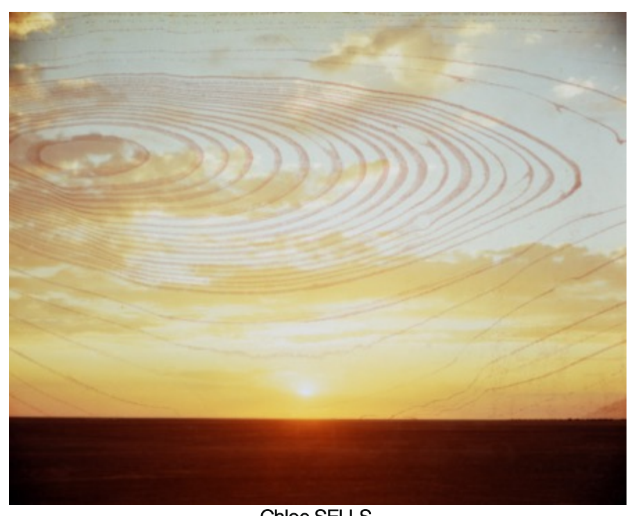
Chloe SELLS How soon is now, 2019 C-Type print with ink 10 x 12 cm Unique