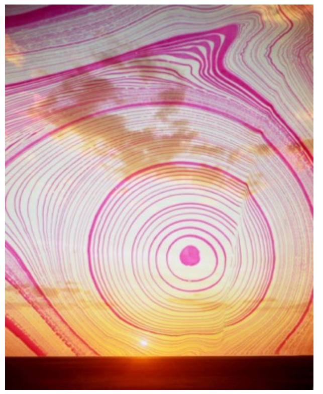
CHLOE SELLS Rage against the coming of the light C-Type print with acrylic paint 10 x 12 cm Unique (c) Chloe Sells / Galerie Miranda