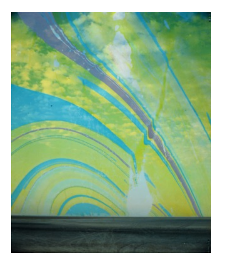
Chloe SELLS Fall at my door, 2019 C-Type print with ink 10 x 12 cm Unique