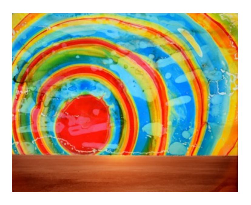
Chloe SELLS Feel the sun, 2019 C-Type print with ink 10 x 12 cm Unique