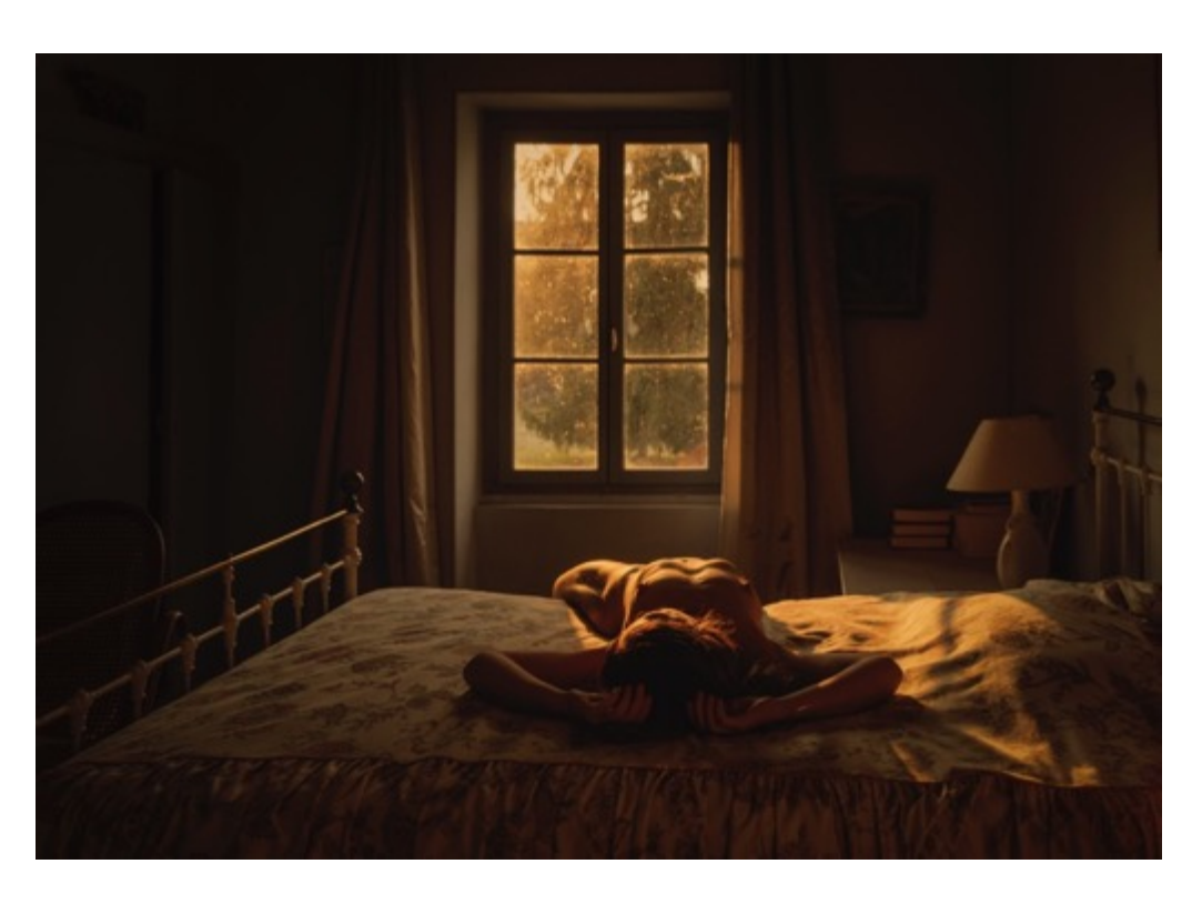
LAURA STEVENS Altar (2023) Archival pigment print 70x100cm