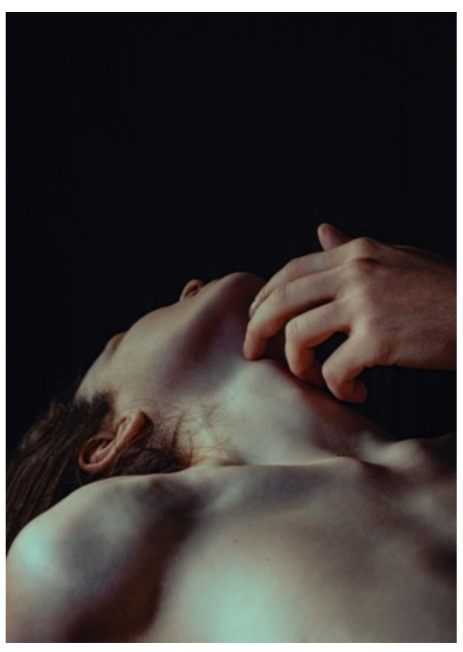
LAURA STEVENS Hymn (2023) Archival pigment print 50x65 cm