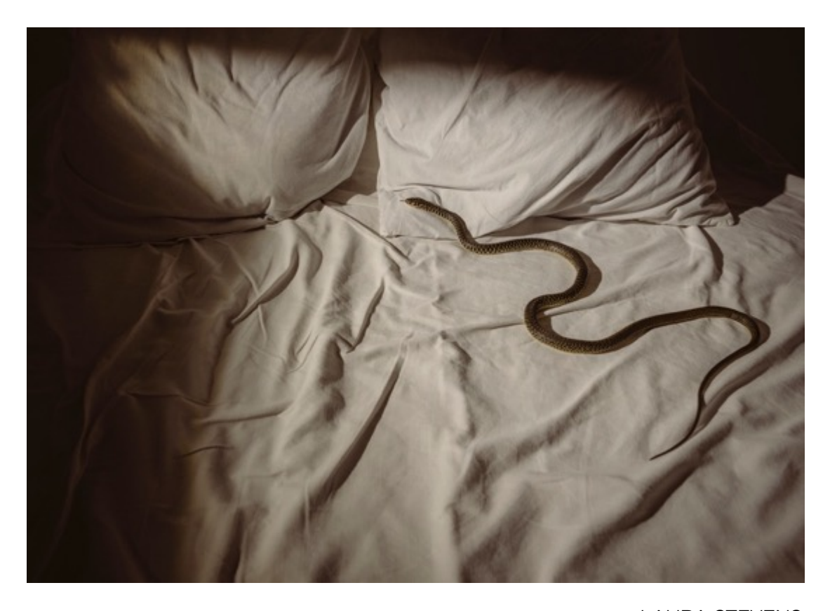
LAURA STEVENS Snake (2023) Archival pigment print 70x100cm