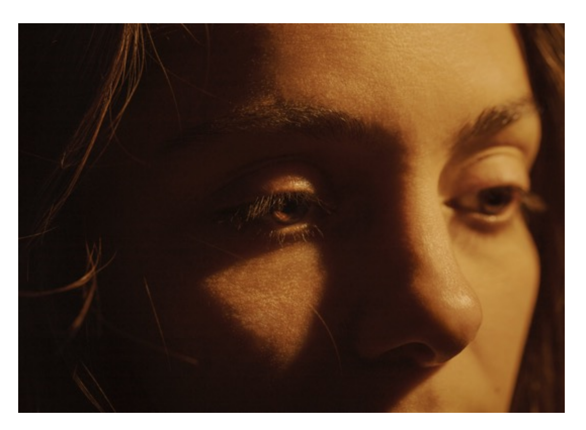
LAURA STEVENS Surface (2023) Archival pigment print 50x65 cm