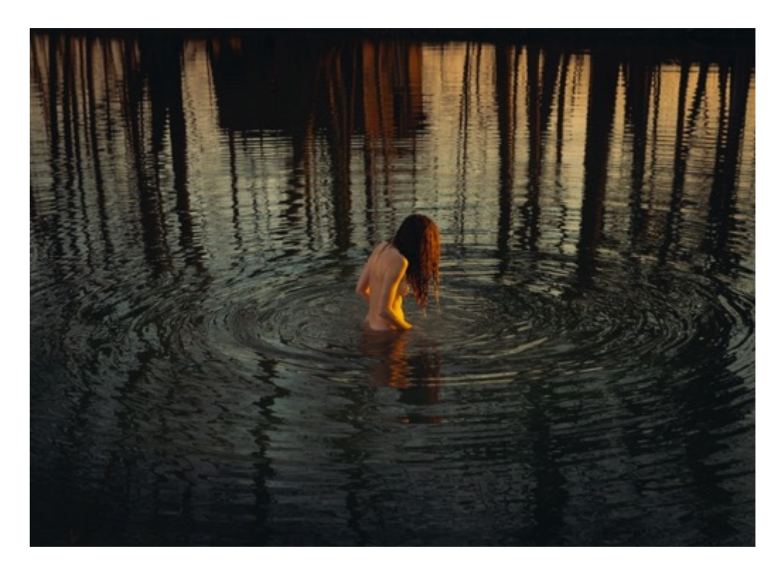
LAURA STEVENS Threshold (2023) Archival pigment print 70x100cm