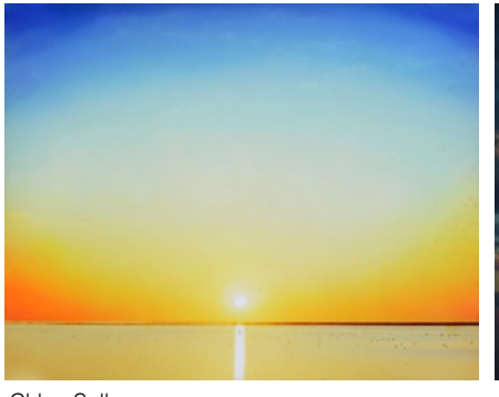
Chloe Sells Handsome Boy, 2015 Unique handmade chromogenic print with ink 10 x 12 cm