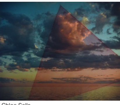
Chloe Sells Leave me like this, 2017 Unique handmade chromogenic print with ink 10 x 12 cm